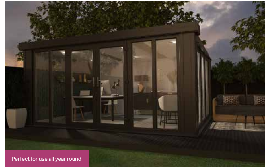
Perfect for use all year round