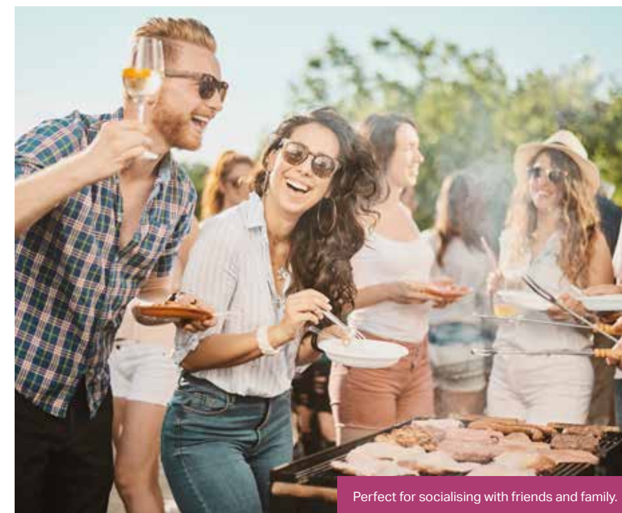
Perfect for socialising with friends and family.