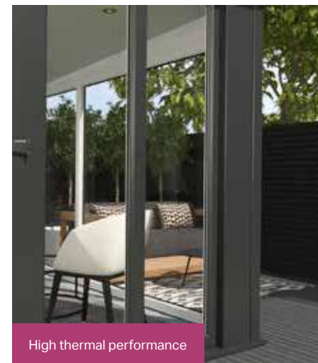
High thermal performance