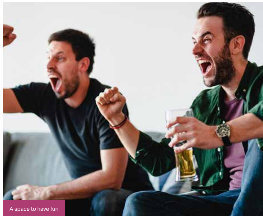
A space to have fun

Appreciate the beauty of the outdoors and have fun in the warmth of an Ultraframe Garden Room.