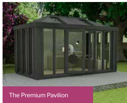
The Premium Pavilion

The inline columns, available exclusively on The Premium Pavilion, not only make a style statement but enable you to have 3 glazed walls which deliver a high thermal performance and bring in even more natural light.