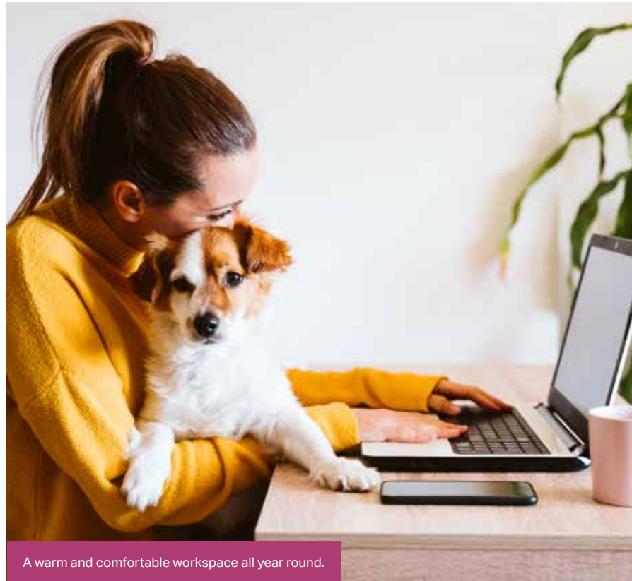
A warm and comfortable workspace all year round.

Providing a warm and comfortable workspace all year round, they are also very efficient to run. Our range of floorplans give you plenty of options for break-out areas and co-working.