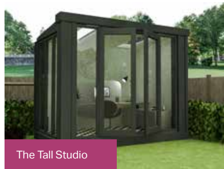
The Tall Studio

With extra height The Tall Studio at 2900mm high is ideal for a variety of activities, and perfect for home gym equipment.