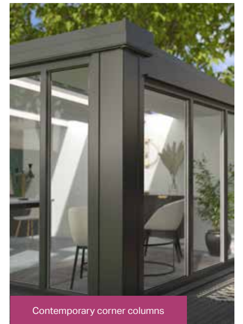
Contemporary corner columns