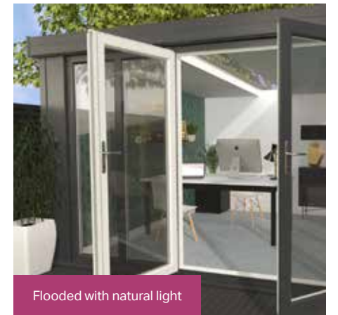
Flooded with natural light